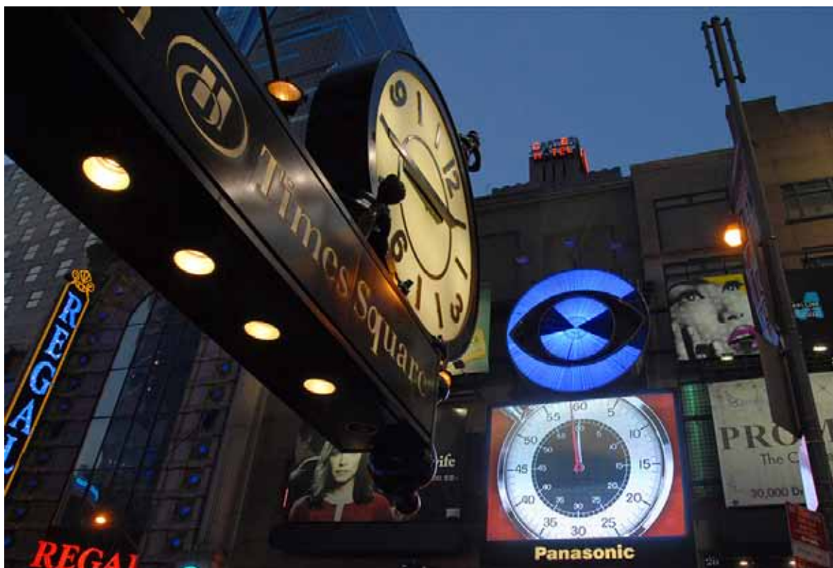
CBS Spectacular located on 42 nd Street

Neutron Media Inc., in association with CBS, is making available a truly unique and amazing opportunity for advertisers to get their message to millions of consumers during the largest spending period of the year!