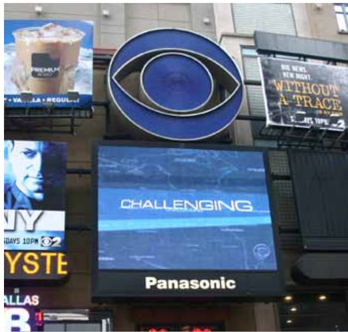
CBS Spectacular located on 42 nd Street

Neutron Media Inc. in association with CBS, is making available a truly unique and amazing opportunity for advertisers to get their message to the millions of consumers that emerge from hibernation after the long winter.