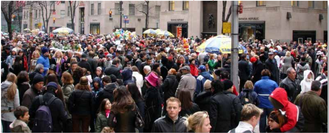
St. Patrick's Day Parade

Creative Format: Uncompressed QuickTime (.mov) 720 x 480, NTSC (4:3)