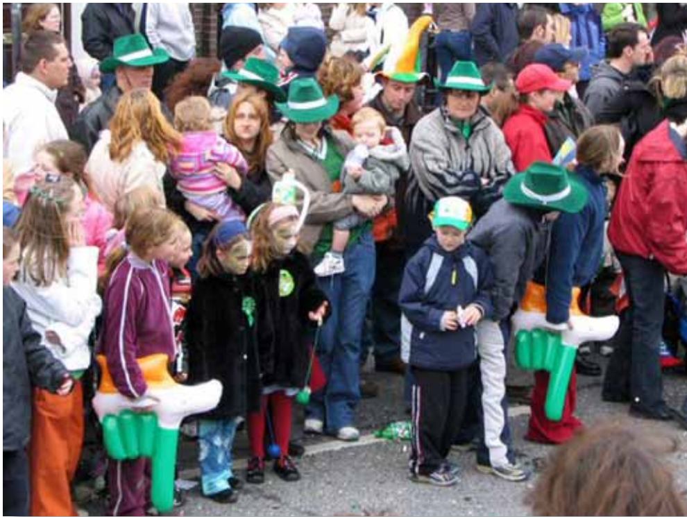
St. Patrick's Day Parade

This state-of-the-art, full-motion, full-colour spectacular is 26’ wide by 20’ high, totaling 520 square feet.