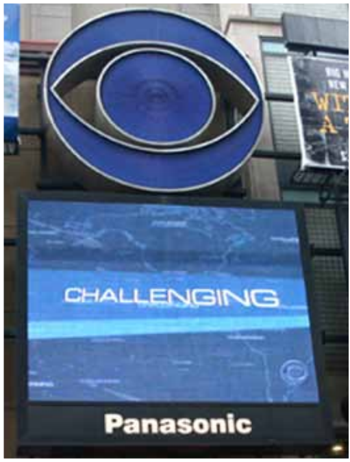
CBS Spectacular located on 42 nd Street

Neutron Media Inc., in association with CBS, is making available a truly unique and amazing opportunity for advertisers to get their message to millions of consumers .