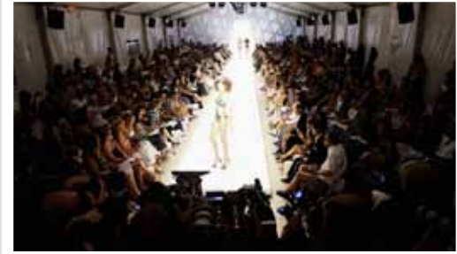
Mercedes-Benz Fashion Week