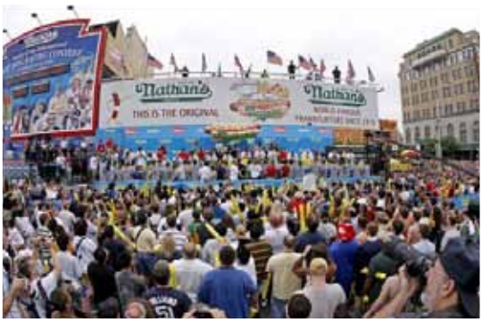
Nathan's Hot Dog Eating Contest