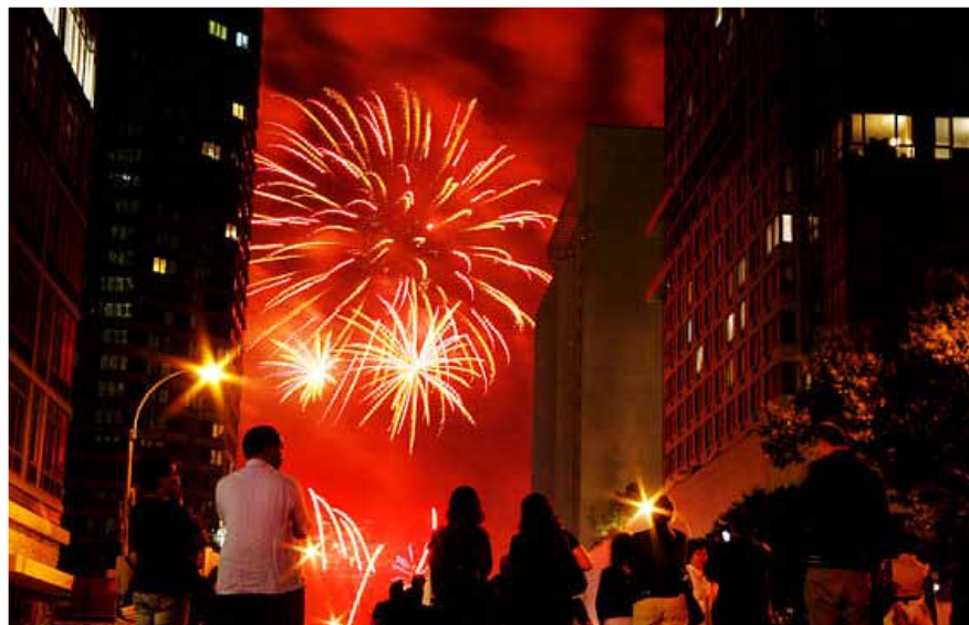
Spectacular view of Macys 4th of July Fireworks from 42nd Street.

This is the ***STAR-STUDED STAGE*** for your global brand. It delivers to a captive audience of New York's business commuters, as well as visitors to this energetic city.