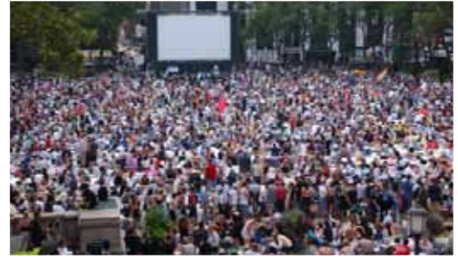
Bryant Park Film Festival