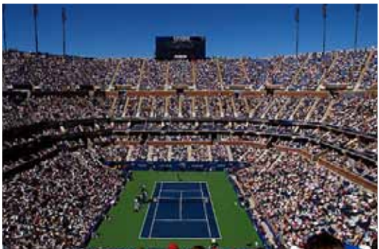
Record Crowds at the U.S. Open 2010

This is a MASSIVE opportunity - DON'T MISS OUT! Send your message to the BIGGEST AUDIENCE in the USA!