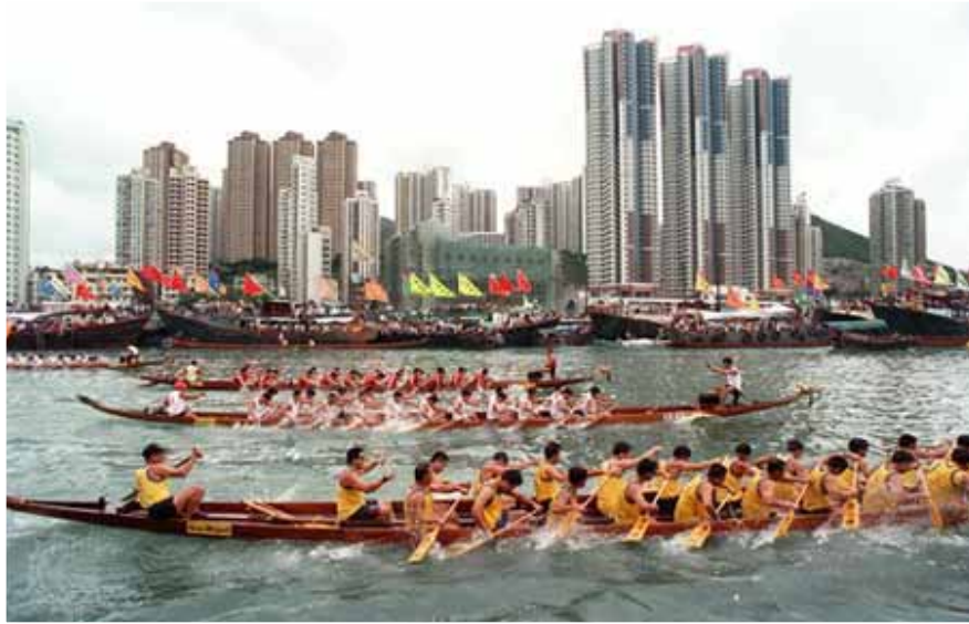
Hong Kong Dragon Boat Festival - NYC

“Times Square, where the World meets America.” Perfect for your media message.