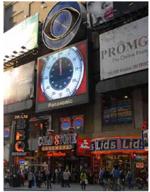
CBS Spectacular located on 42 nd Street

This state-of-the-art, full-motion, full-colour spectacular is 26' wide by 20' high, totaling 520 square feet.