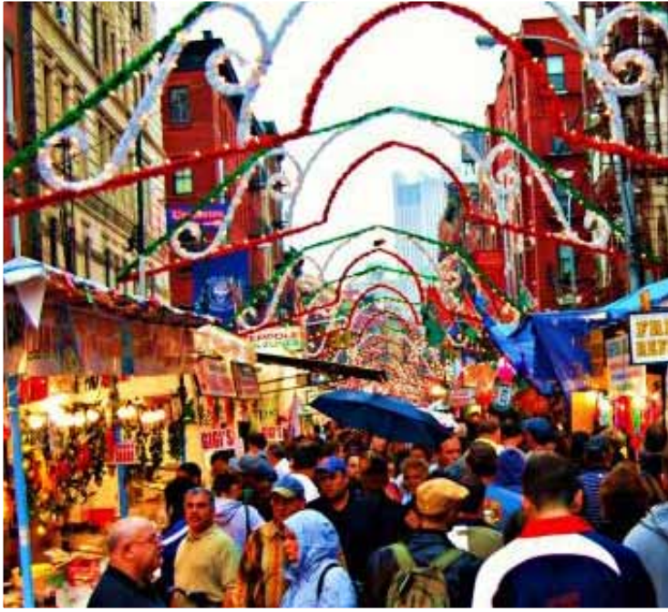
San Gennaro Festival