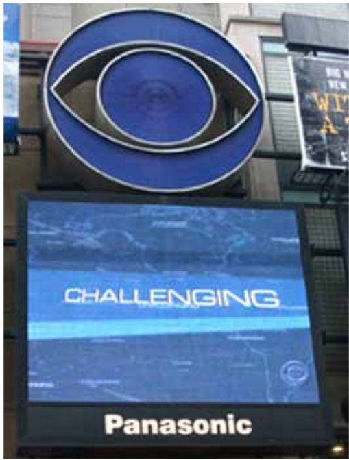
CBS Spectacular located on 42 nd Street

Neutron Media, in association with CBS, is making available a truly unique and amazing opportunity for advertisers to get their message to millions of consumers during this exciting WORLD EVENT .