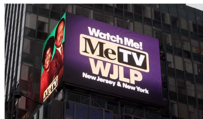
MeTV - WJLP