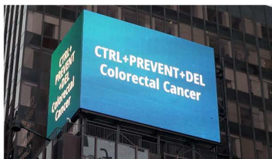
Center for Disease Control